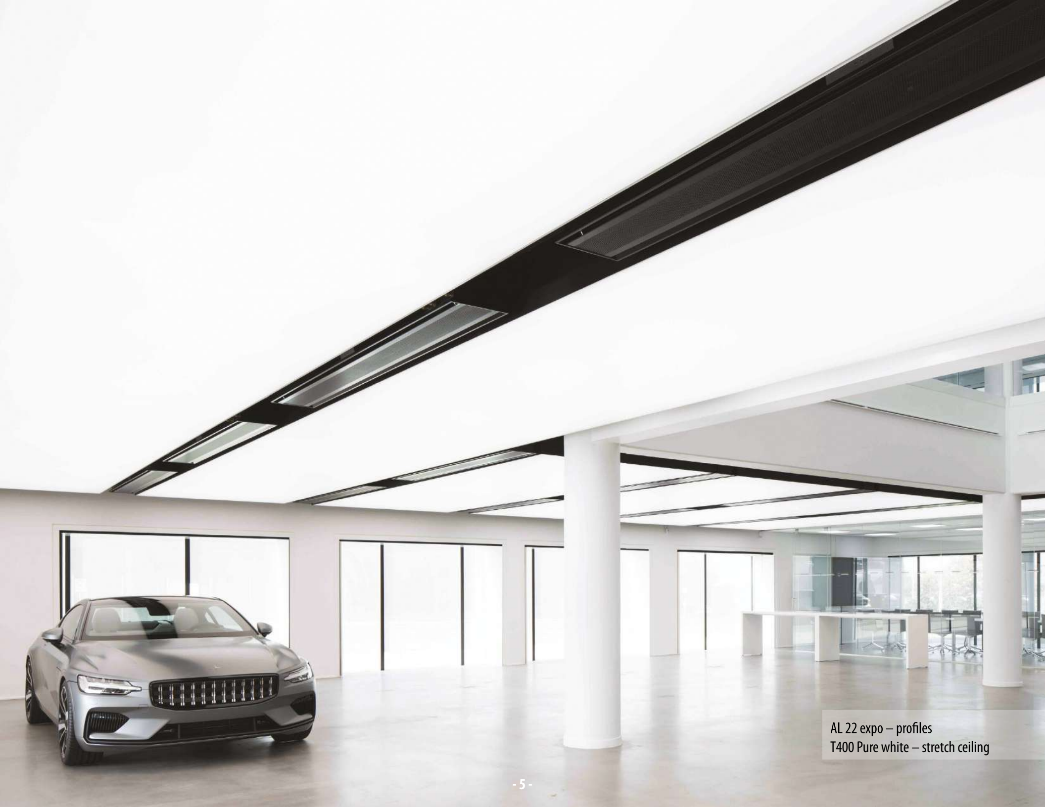
AL 22 expo – profiles T400 Pure white – stretch ceiling