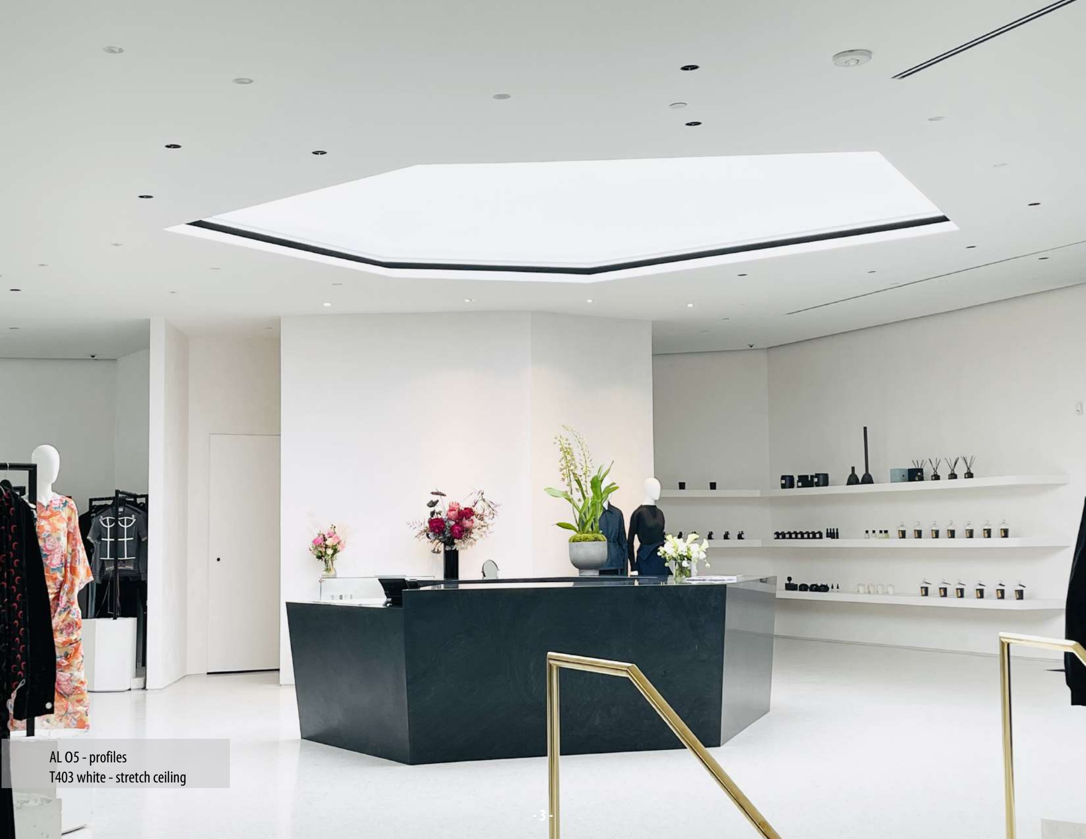
AL 05 - profiles T403 white - stretch ceiling