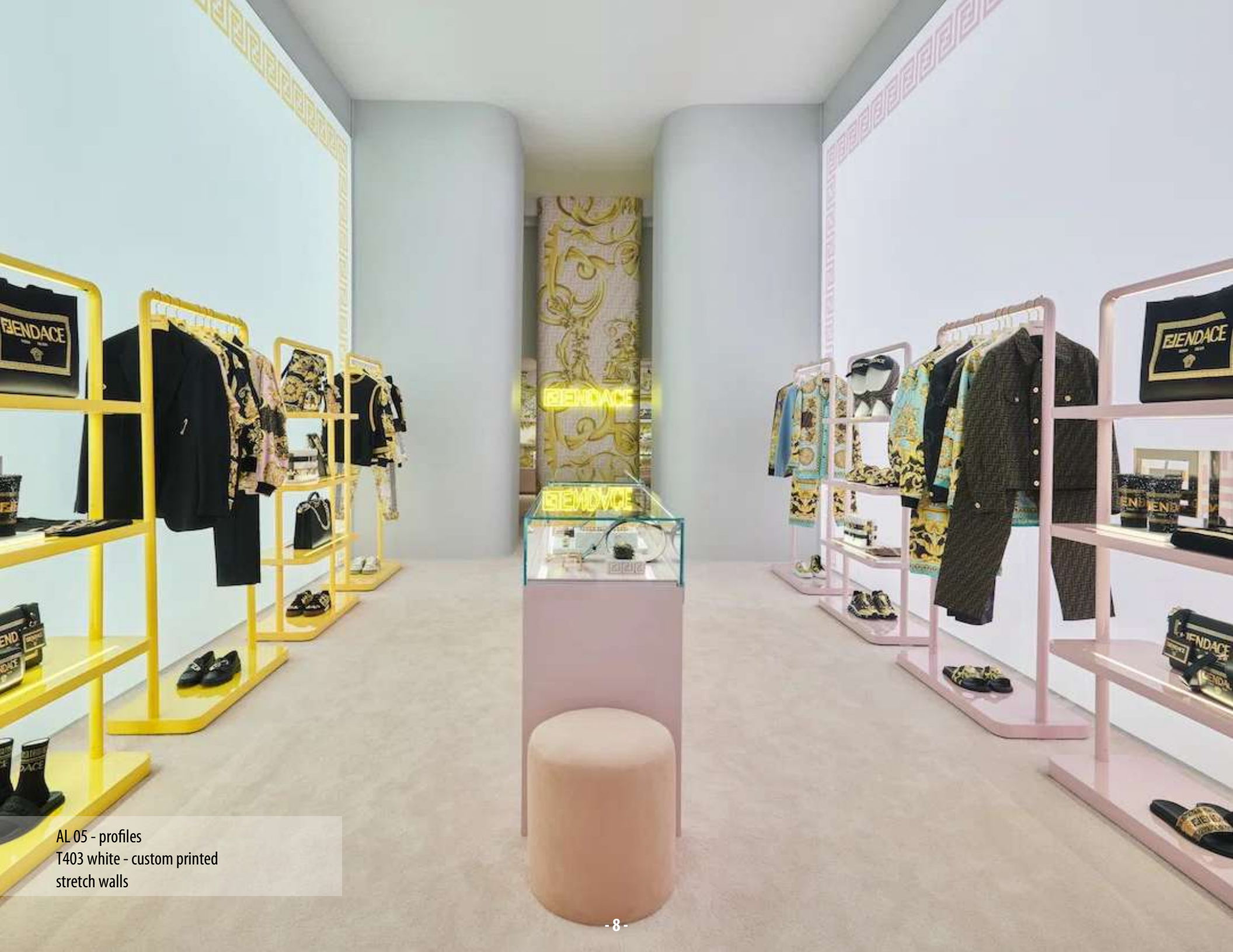
AL 05 - profiles T403 white - custom printed stretch walls